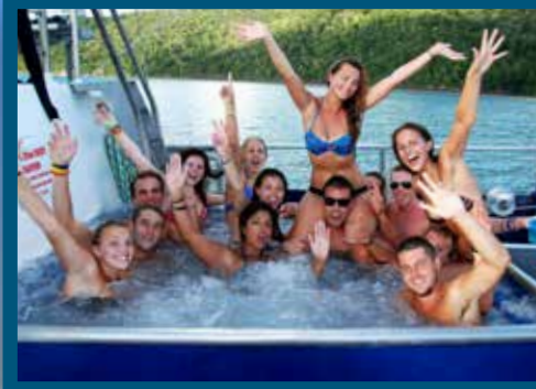
Splash around in the on board spa!