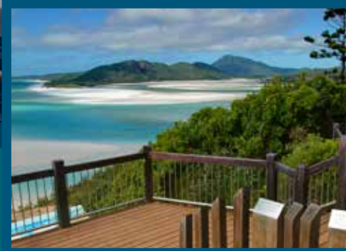
Create memories of a lifetime.