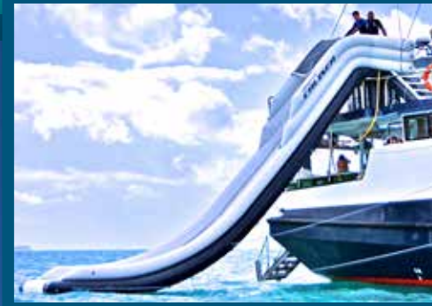
Fly down the 9 metre water slide!