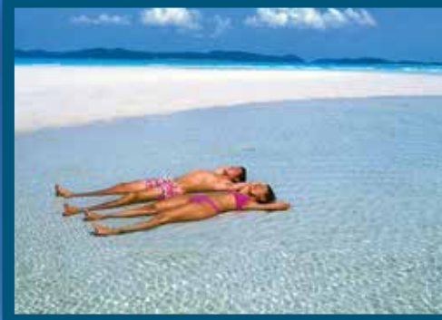
Relax and enjoy the sunshine.