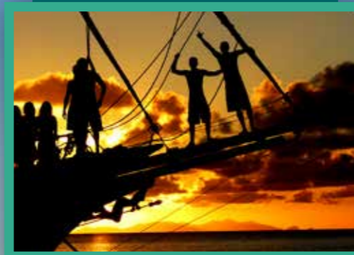
Awaken your senses.