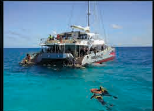
With guided snorkel tours running all day