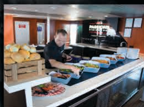
Lunch and afternoon tea served on the Great Barrier Reef