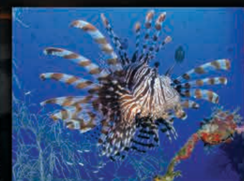
Then discover the wonders in our backyard