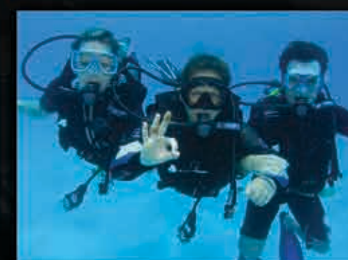
Low Diver to Instructor ratio