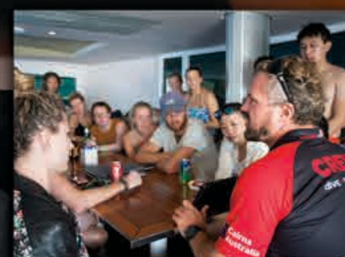
On the way home learn from our marine life presentation