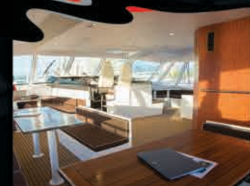
Sit with the Captain in our upper indoor saloon