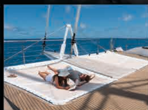
Sunbath in style on our signature boom nets