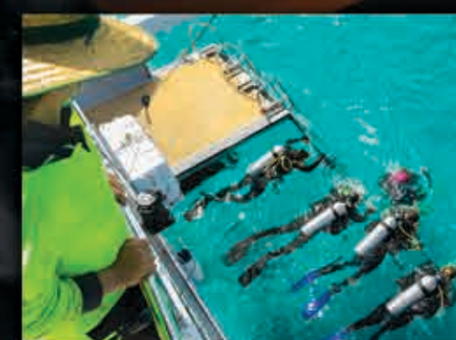
Thorough Introductory dive briefings followed by clear in-water tuition