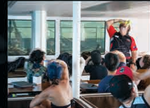
Snorkel tuition on the way to the reef