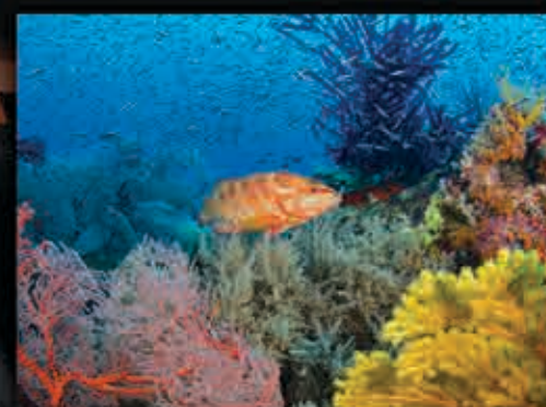
Our sites are handpicked daily and tailored to the conditions