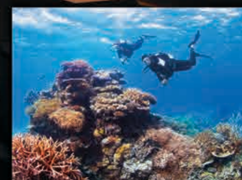
Certified Divers receive a detailed site briefing with their guide