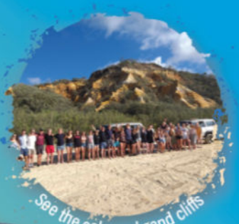
See the coloured sand cliffs of Fraser Island