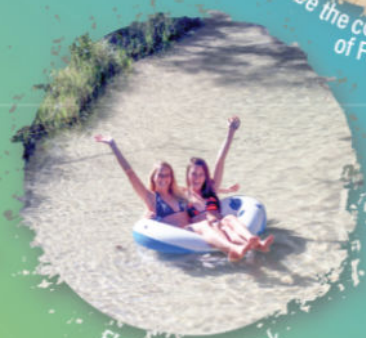
Float down Eli Creek

Lake McKenzie • Lake Wabby • Central Station