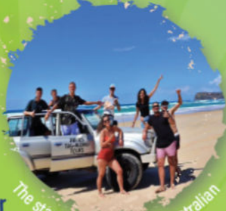
The start of your ultimate Australian 4WD Beach Adventure