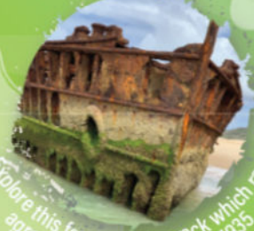
Explore this famous shipwreck which ran aground during a cyclone in 1935