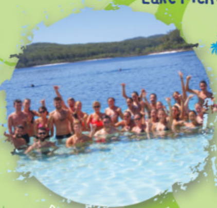
Relax in crystal clear water

Lake McKenzie • Lake Wabby • Central Station