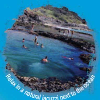
Relax in a natural jacuzzi next to the ocean