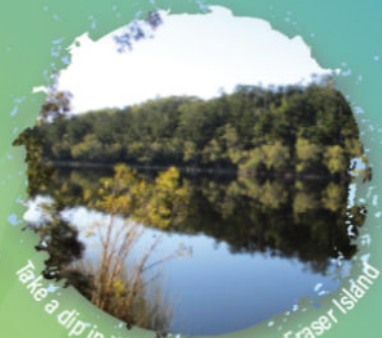
Take a dip in the deepest lake on Fraser Island followed by a lunch on the beach