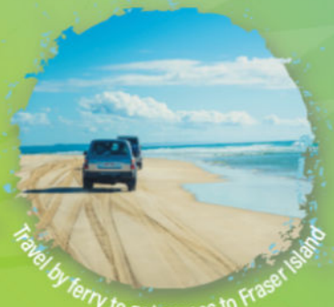
Travel by ferry to get across to Fraser Island