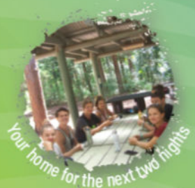
Your home for the next two nights