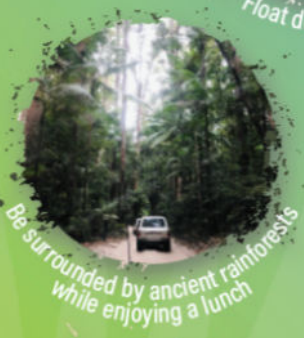
Be surrounded by ancient rainforests while enjoying a lunch