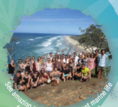
See amazing ocean views and spot marine life from Fraser Island's highest point